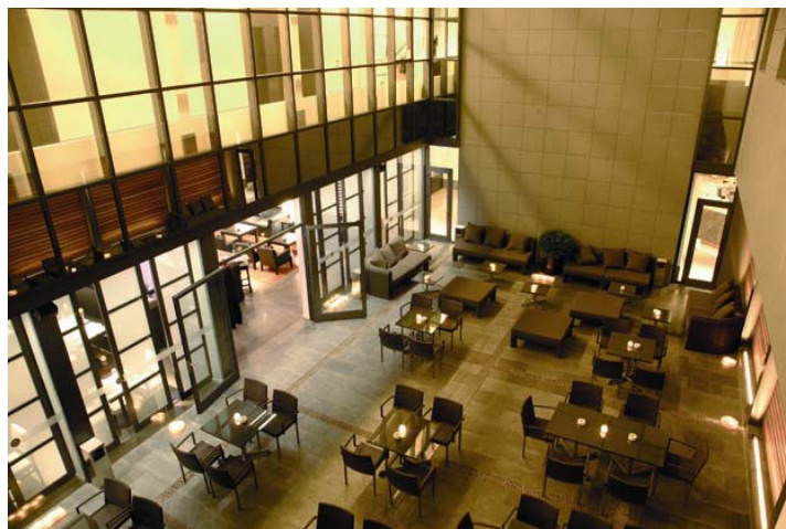
Interior of the new Hotel MOLINA LARIO

The group is positioned at the high end of the business traveller market and has managed to obtain a 60% rate of returning clients.